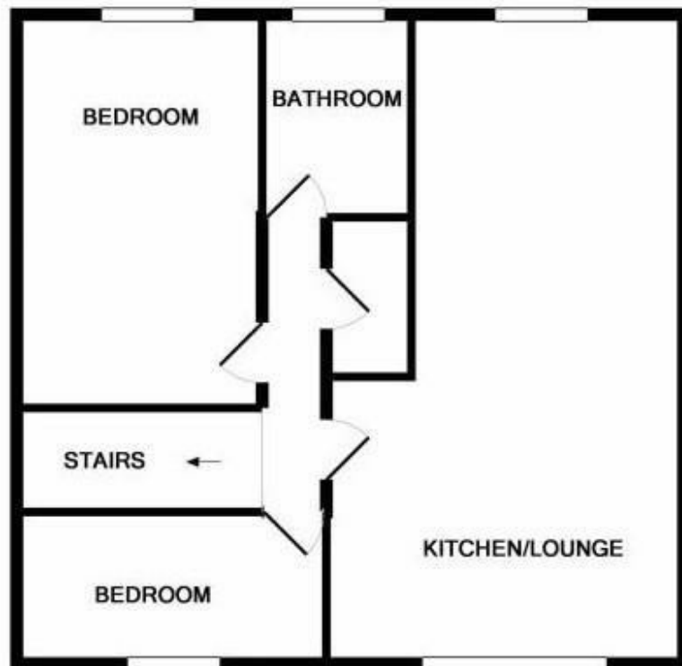
1ST FLOOR APPROX. FLOOR AREA 593 SQ.FT. (55.1 SQ.M.)